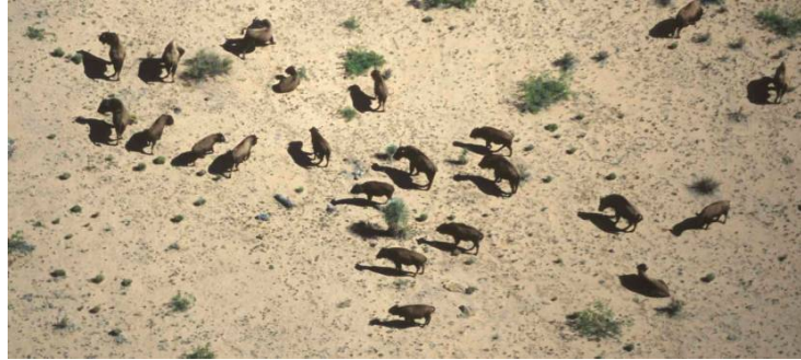
The Janos-Hidalgo herd is the most southern wild bison population in North America. It resides in arid grasslands in the border area between Chihuahua and New Mexico.