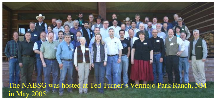
The NABSG was hosted at Ted Turner's Vermejo Park Ranch, NM in May 2005.

The NABSG is a network of people involved in bison conservation and recovery who are able to contribute scientific knowledge, effectively influence bison conservation, or engage in conservation projects. There are more than 60 registered members and numerous collaborators spanning the range of the